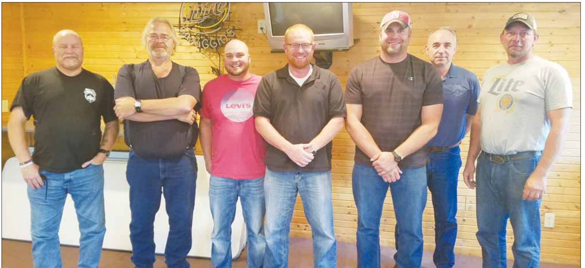
Members from BSD Local Lodge 1490 gathered for a regular meeting in Erskine, Minn.

You can now visit the BMWED on Facebook at Brotherhood of Maintenance of Way Employes , and follow us on Twitter at BMWEDIBT .